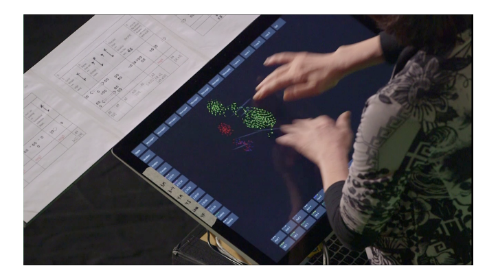
Figure 2: Evolutionary music performance surface for engagement with agents, and a portion of a performance score.

The iterative cycle of Phase III typically unfolds as follows: 1) Estimating the duration and number of sections, then subtracting or adding more types by redesigning the properties of agent groups. 2) After examining similarity and contrast of behaviors, subsections are sketched out. 3) Further sketching with behavioral mapping and sound generator refinement determines which section requires how many number of subsections