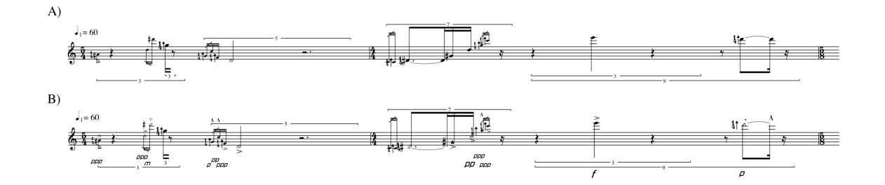
Figure 3. A) Pitch and rhythmic rendition sample, B) Expressive notation rendition sample.